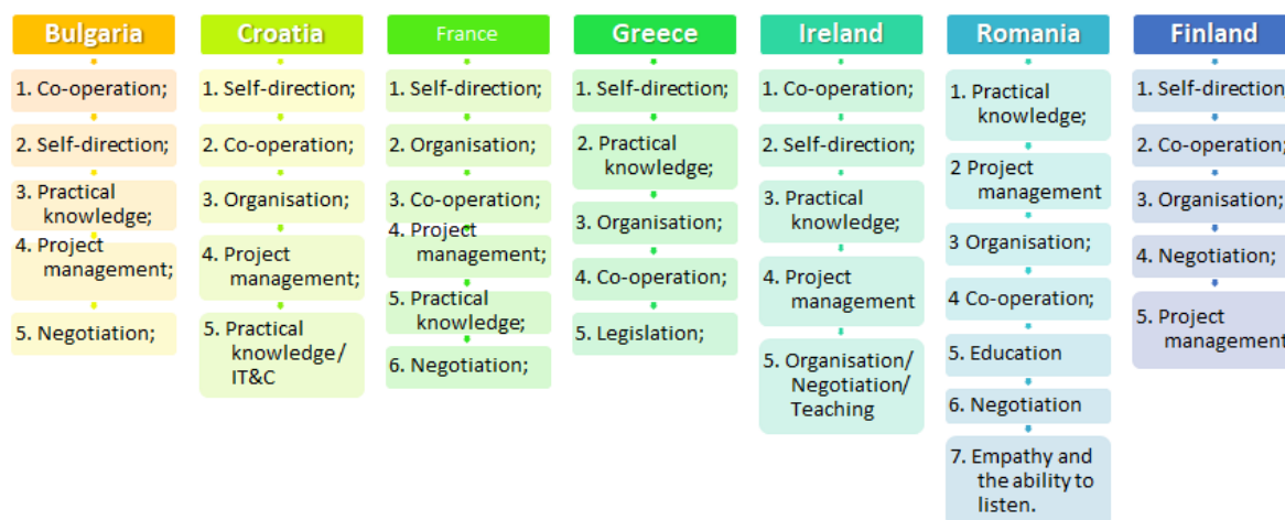
Figure 3: Identified skills needed by future graduates to improve the sustainability of the peripheral rural area

Firstly, we have produced a report that delineates the identified gaps in the HE relating to peripheral rural areas and the needs of the local actors (working on those areas). Figure 3 identified the gap between the knowledge and the skills that graduates acquired and the knowledge and skills required by local actors to work in such areas.