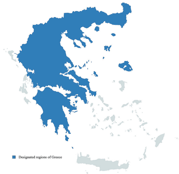
Figure 1. Designated regions of Greece for Feta cheese production.

unique sensory entity within the cheese universe, warranting exploration from both scientific and gastronomic perspectives. [21]