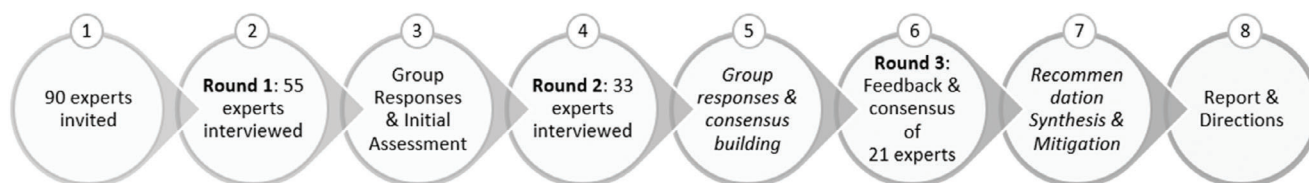
Figure 3. Methodology implementation steps.

A panel of 90 experts and stakeholders with expertise in food safety, food security and authenticity, supply chain management, and related fields was initially identified. These stakeholders included representatives and employees from the “Olympos – Hellenic Diaries SA” producer and the “Masoutis S.A.” retailer, as well as other experts from the field. This selection was crucial for obtaining insights into the intricacies of the PDO Feta cheese SCs and associated risks.