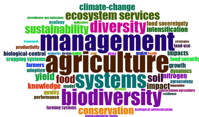
Figure 2. Representation of the most frequent terms.