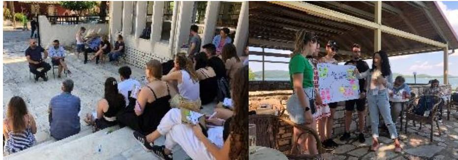
Figure 4: Summer school in Greece

Lastly, we have developed Digital Badges to recognise student's learning, knowledge and skills gains. Digital Open Badges provide unlimited ways of communicating knowledge, skills, and competencies. In the course of RUR'UP project, they were used to validate key milestones reached within the online course and skills the student has acquired in each stage of the course. The Digital Badge is in the form of an online certificate that contains the metadata which describes: the name of the badge, its description and criteria page. We have developed in total three digital badges, two for the e-course and one for the completion of the summer school these were: